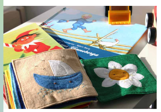
iDiv child care