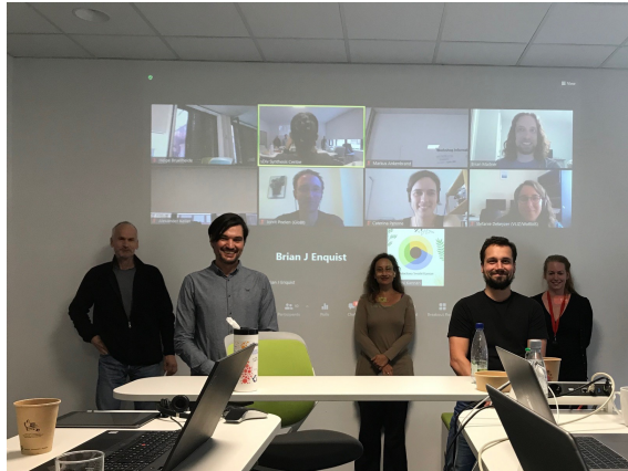
sDevTrait working group picture