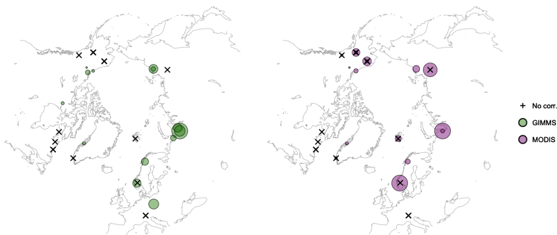
Figure 1. Tundra shrubs show variable correspondence with satellite-observed greening trends. Maps of the proportion of individuals at a given